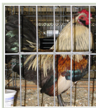
Figure 1. Examples of a well-bedded cage and a well-groomed Black Rosecomb hen and Old English cock.