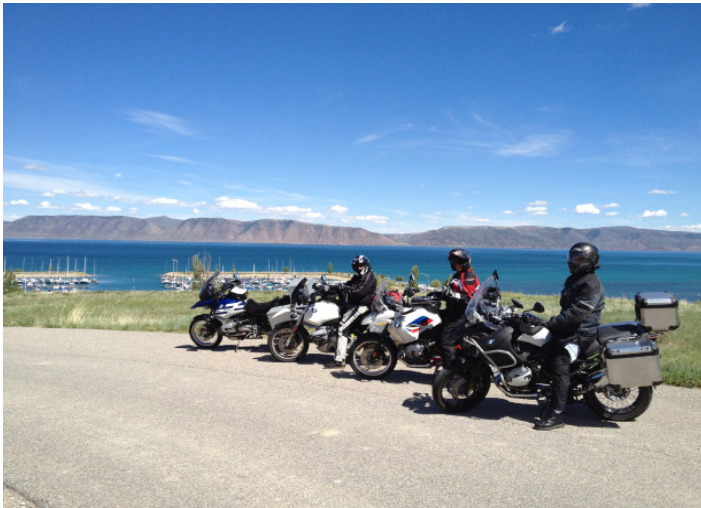
Tourists at Bear Lake, Utah/Idaho

survey. Mail surveys were sent to all 305 respondents, four (1.3%) were returned as undeliverable, and of the remaining 301, 187 surveys were returned for a mail survey response rate of 62.1 percent.