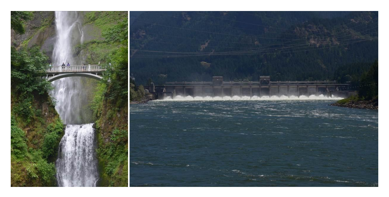
Figure 3. Multnomah Falls and Bonneville Dam Spillway