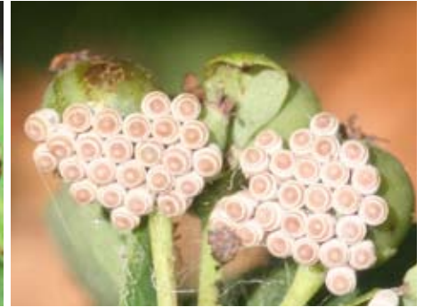
Fig. 11. Stink bug eggs. 2