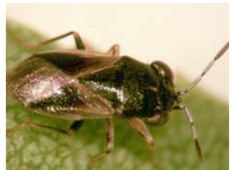
Fig. 7. Bigeyed bug adult. 4