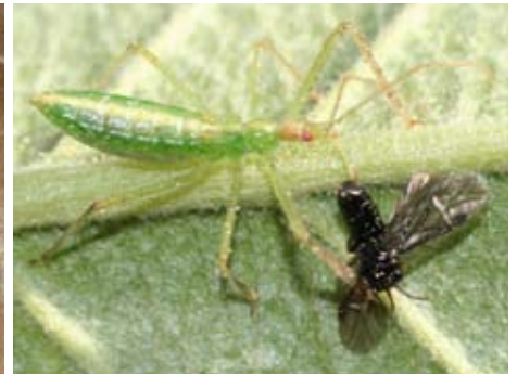
Fig. 5. Assassin bug nymph feeding on a leafminer fly. 2