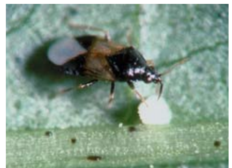
Fig. 9. Minute pirate bug adult feeding on an insect egg. 5