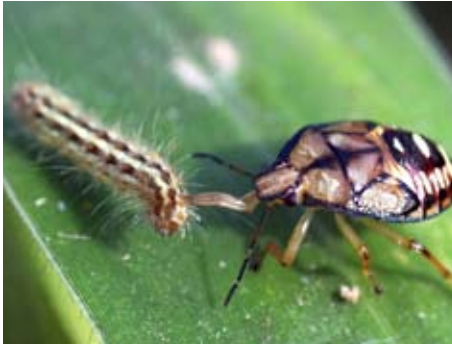
Fig. 10. Spined soldier bug nymph eating a caterpillar. 6

Pentatomidae is a large family of stink bugs, with over 4,500 species in the world. In general, stink bugs are larger (8-20 mm in length) and wider compared to other true bugs (Figs. 3, 10). All stink bugs are usually green or brown camouflaged to blend in the background (Fig. 11). Adults resemble a shield and have a stubby beak. If disturbed, stink bugs will emit a rancid liquid derived from cyanide compounds. Stink bugs can be found in fields, meadows, and on herbaceous plants. These predators will feed on eggs and caterpillars.