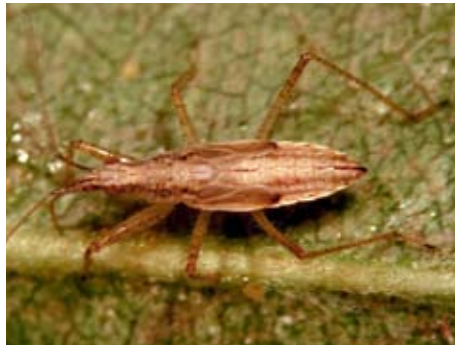
Fig. 12. Damsel bug nymph. 4

Nabidae is a family of predatory damsel bugs, with about 400 species in the world. Adults range from 8-12 mm in length, and are considered thin and soft-bodied compared to other true bugs (Figs. 12-13). Most damsel bugs are brown in color and grasping forelegs. These predators are found in low vegetated areas and prey on many crop pests, including caterpillars, aphids, and plant-feeding bugs.