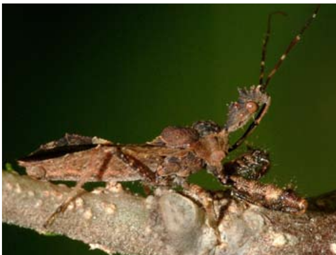
Fig. 1. Spined assassin bug adult. 1

True bugs, and all Hemipterans, go through simple or incomplete metamorphosis. Males and females will mate end-to-end (Fig. 3), or facing away from each other. Mated females lay eggs singly or in small masses near potential food sources. Nymphs hatch from the eggs and begin to search for small prey items. Nymphs look similar to the adults except they are smaller in size and lack functional wings; nymphs will develop wing pads as they mature. They pass through five instars before finally molting into an adult. Total development time is dependant on the weather, but generally there are several generations per year.