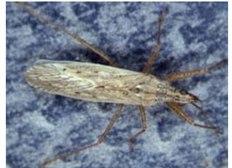
Fig. 13. Damsel bug adult. 2