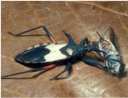
Fig. 4. Assassin bug adult feeding on a fly. 3

Reduviidae is a large family of assassin bugs with more than 7,000 species in the world. Adults range from 4-40 mm in length and are brown, black, red or orange in color. Most assassin bugs have an elongated head accentuated by a narrow neck, long legs and an obvious curved piercing stylet or beak (Figs. 1, 4-5). Another distinctive trait is the tip of the beak fits into a groove of the thorax and rasps against ridges to produce sound. Assassin bugs eat a variety of prey, including grasshoppers, beetles, flies, bees, and other plant-eating true bugs.