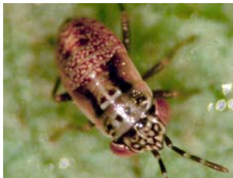
Fig. 6. Bigeyed bug nymph. 4

Geocoridae is a small family of predatory insects, with only 275 bigeyed bug species in the world. Adults are brown or black in color, and range from 3-5 mm in length. Adults have a triangular head with large, prominent eyes that occasionally extend over the back (Figs. 6-7). These predators are commonly found on weeds, sparse grass, in woods and near streams. Prey items include eggs, caterpillars, leafhoppers, mites, thrips, whiteflies, and aphids. Sometimes bigeyed bugs are mistaken for chinch bugs or other pests.