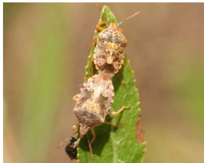
Fig. 3. True bugs mate end-to-end. 2