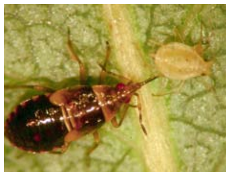
Fig. 8. Minute pirate bug nymph feeding on an aphid. 4

Anthocoridae are small predatory bugs, with about 600 species in the world. Adults range from 0.5-6 mm in length and have dark bodies with black and white forewings (Figs. 8-7). Minute pirate bugs have oval bodies that are somewhat flattened. Adults have large, prominent eyes. These predators are found in ground litter and grass, and attack insect eggs, aphids, scales, and spider mites. Minute pirate bugs are also released into greenhouses for biological control.