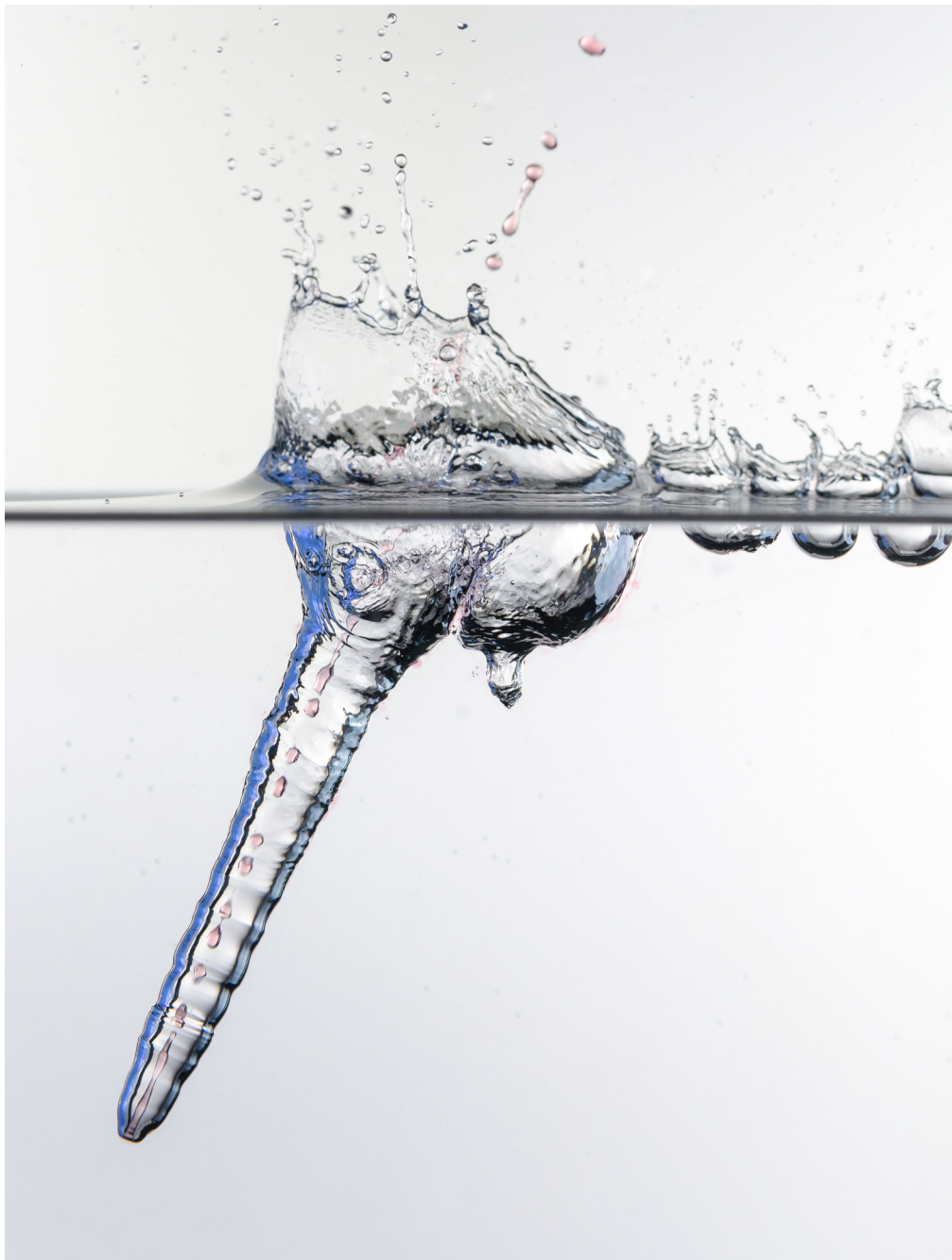
FIG. 2. A stream of pink-colored droplets impacts a water surface, forming a series of nested cavities that combine to form a matryoshka cavity. http://gfm.aps.org/meetings/dfd-2014/54174c1769702d585cf40200 .

stream produces a long conical cavity. Fig. 2 presents an extensive cavity formed by approximately 15 droplets impacting the water surface in succession, and is approximately 14 times deeper than a cavity created by a single droplet. It is likely that this image does not represent the upper limit of the cavity proportions that can be achieved. 4