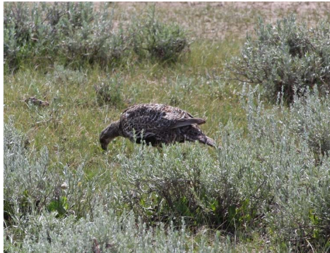
A sage-grouse adult female foraging during the summer.

weeks of life. Sage-grouse chicks usually hatch from late May to early June. The need for forbs seems to increase through the summer, as the percent of insect matter they eat decreases as they grow older (Figure 2). They begin eating sagebrush after 4 weeks of age. By November, their diet matches that of adult sage-grouse (Table 3). However, in areas where more forbs are available, they may continue to prefer forbs to sagebrush.