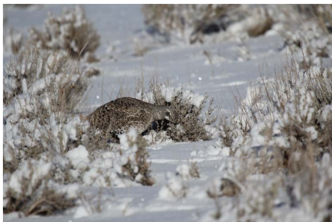
Sage-grouse female eating black sagebrush (A. nova) during the winter.

Greater sage-grouse ( Centrocercus urophasianus ; sage-grouse), as their name implies, depend on sagebrush ( Artemisia spp.) for their survival. In fact, during the winter sage-grouse survive by only eating sagebrush.