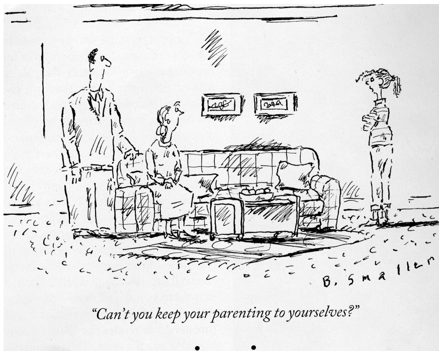
Figure 3. Cartoon #3