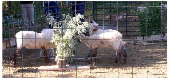
These lambs have been trained to eat Russian olive (left) and avoid Carrageena (right).

rangelands, they rarely over-ingest toxins because rapid post-ingestive feedback from toxins tells them to limit the amount of toxic food eaten. Thus, the amount of toxin in a food sets a limit on the amount of a particular food an animal can eat (Burritt and Provenza 2000). If toxin levels in a plant decline over the growing season, palatability and intake of the plant increases. That's why, when given a choice, ruminants are able to select plants that are higher in nutrients and lower in toxins than the average of the plants available on pastures or rangelands.