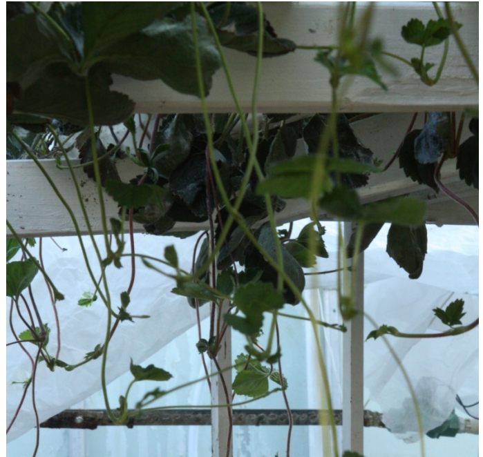
Figure 3 Suspended growing system with hanging runners

Greenhouses provide the ideal setting for runner production. Greenhouses can be managed to provide ideal day time temperatures (above 75°F) and long photoperiods (about 16 hours). With supplemental heat and light, runner production can occur year round. Elevated planting beds in the greenhouse facilitate runner harvesting. PVC rain gutters filled with a soil-less potting mix provide a simple and efficient elevated production system (Figure 2). Plants are spaced 9 to 12 inches apart in the gutters. The resulting small root volume requires frequent irrigation and fertilizer application. Drainage holes should be drilled in the bottom of the gutters to prevent water saturation of the soil. Irrigation events will vary with different planting configurations; however, the principles are the same.