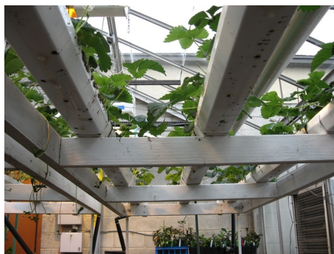
Figure 2 Suspended growing system