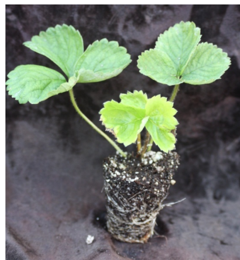
Figure 1 Strawberry Plug Plant

Plug plants are relatively easy to grow and can be produced in a small greenhouse or cold frame. Dormant cold-stored mother plants are planted in the late spring/early summer to produce runner tips for propagation. If mother plants are ordered in January or