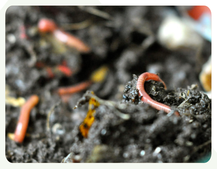
Worms can consume their own weight in food EVERY DAY!

Vermicomposting, or worm composting as it is more commonly known, is the process of using worms to break down discarded food and other organic wastes and convert them into compost and liquid fertilizers. Not only will this process save you money, but it will also downscale your environmental footprint. Vermicompost systems can be purchased online or assembled cheaply by up-cycling materials found around the house or at a local thrift store.