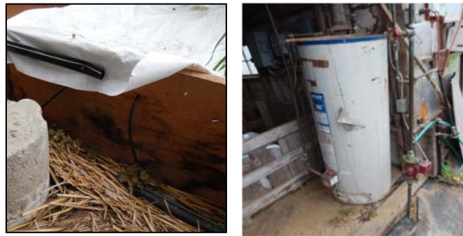
Image 3. Hot water is pumped through flexible tubing buried in the soil.

Heating cables can be purchased from various manufacturers (online) or, from local sources. Heat cables, if installed properly and handled carefully, can be reused for 2 to 4 years. They require an electricity source and care needs to be taken not to damage the insulation around the cable both during installation, and for the life of the planting. Cables are connected to a thermostat that can be set to different temperatures, depending on plant needs. When the soil cools to the set temperature, the cables will automatically turn on and begin warming the soil.