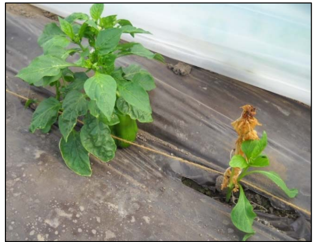
Image 1. Freeze injury on pepper results in replacement growth (or plant death) next to plant without injury.

Supplemental heating may be necessary to keep plants from chilling or freeze injury and may move