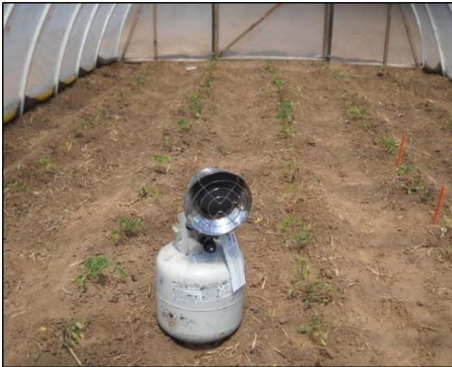
Image 5. Temporary propane heater.

affecting plant growth. The small amount of heat released at night, the loss of space, plus the cost of the barrels may not justify their use. Further, dark colored moist soil acts as a similarly-effective reservoir of heat storage, and has the added benefit of supporting plant growth.