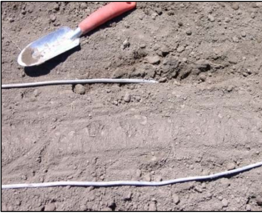
Image 2. Buried electric heating cables.