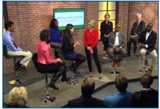
FIGURE 4 Detroit Public Television

Building on a longtime partnership, the foundation and Detroit Public Television worked with the University of Michigan on a concept for a televised town hall with an audience of the Metropolitan Youth Policy Fellows and youth grantees to raise awareness of the power and potential of youth leadership.