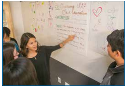
FIGURE 3 Youth Grantee Convenings

who were in their junior or senior years of high school would participate in the lives of the projects, if funded. The grants, ranging from $5,000 to $10,000, were for one-year projects that would help create change in response to the survey findings. The MYPF and YAC members gave feedback and recommendations on the project proposals, and $150,000 was granted to 18 youth-led projects. 4