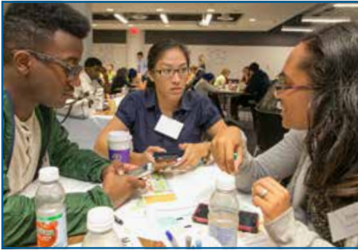
FIGURE 2 Youth Voice Summit

The foundation worked with the MYPF to create a request for proposals. The youths' perspective shaped the overall grant proposal, including the idea of proposals on video in addition to written proposals. This was something the foundation had an interest in piloting, and the young people involved thought the grantmaking program would be a good vehicle.