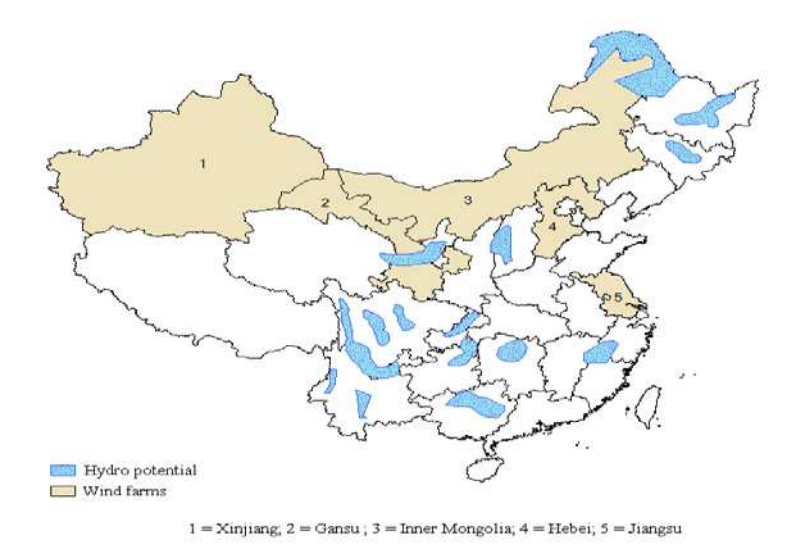
Figure 3: The distribution of hydropower potential and the locations of wind farms in China