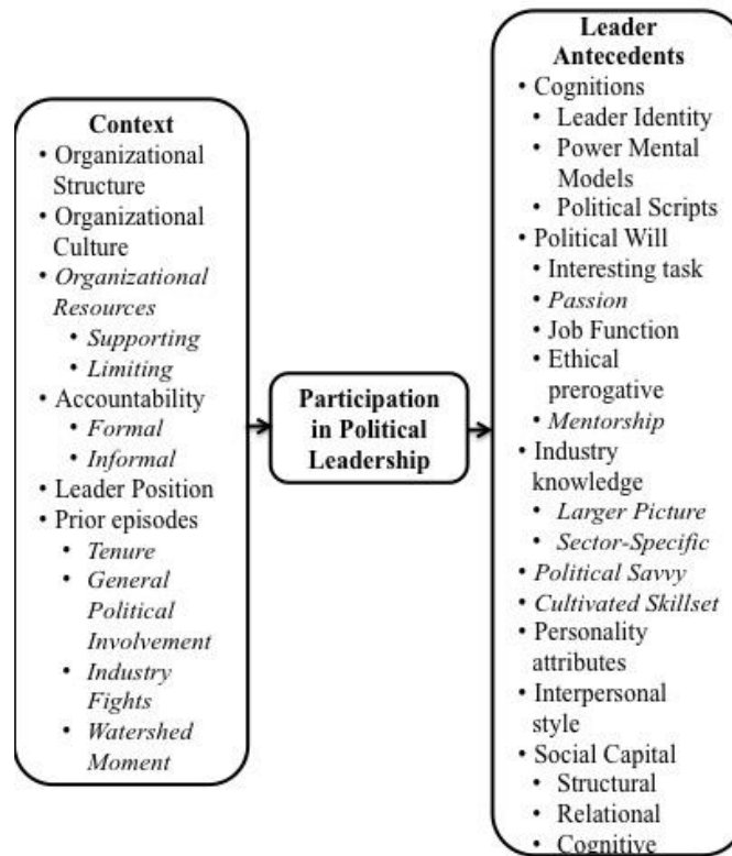
Figure 2. The Context and Leader Antecedents of Tourism Industry Advocates in Virginia (modifications from Ammeter et al. (2002)'s original model italicized).

Based upon the analysis of the qualitative data and secondary sources, multiple themes and subthemes related to the contextual elements and behavioral antecedents of tourism industry advocates in Virginia emerged. Many of the attributes included in Ammeter et al.'s (2002) Political Model of Leadership were identified as important characteristics of advocates in this study. However several additional characteristics were also identified. This required further adaption of the Political Model of Leadership for use in the context of tourism (Figure 2).