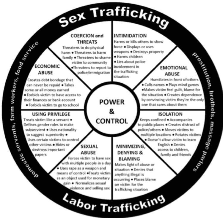
Figure 2: Power and Control Spectrum

abuse. 26 This makes such individuals significantly more vulnerable to the deceptive and coercive methods used by traffickers to control victims. As illustrated in Figure 2, traffickers use techniques within the power and control spectrum to successfully manipulate and therefore exploit individuals. Understanding, in-depth, the psychological trauma of such tactics influences stakeholders, specifically service providers, on how to meet the needs of victims. Such knowledge also serves in enlightening stakeholders to the link between sex trafficking and prostitution, as the same tactics affect victims of sex trafficking as well as prostituted individuals. 27