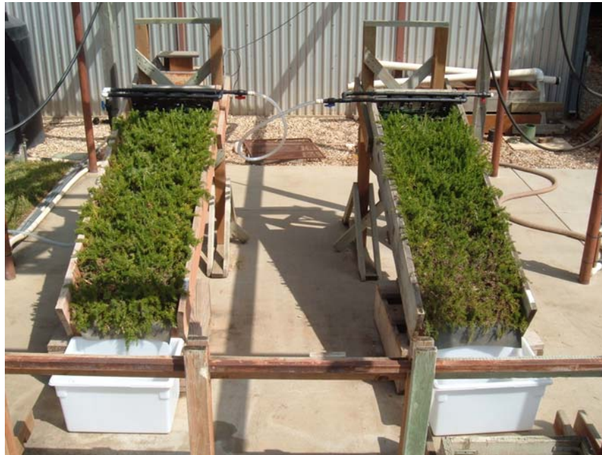
Figure 1. Experimental setup using Rosmarinus officinalis L.

†: See Table 4 for vegetation treatments