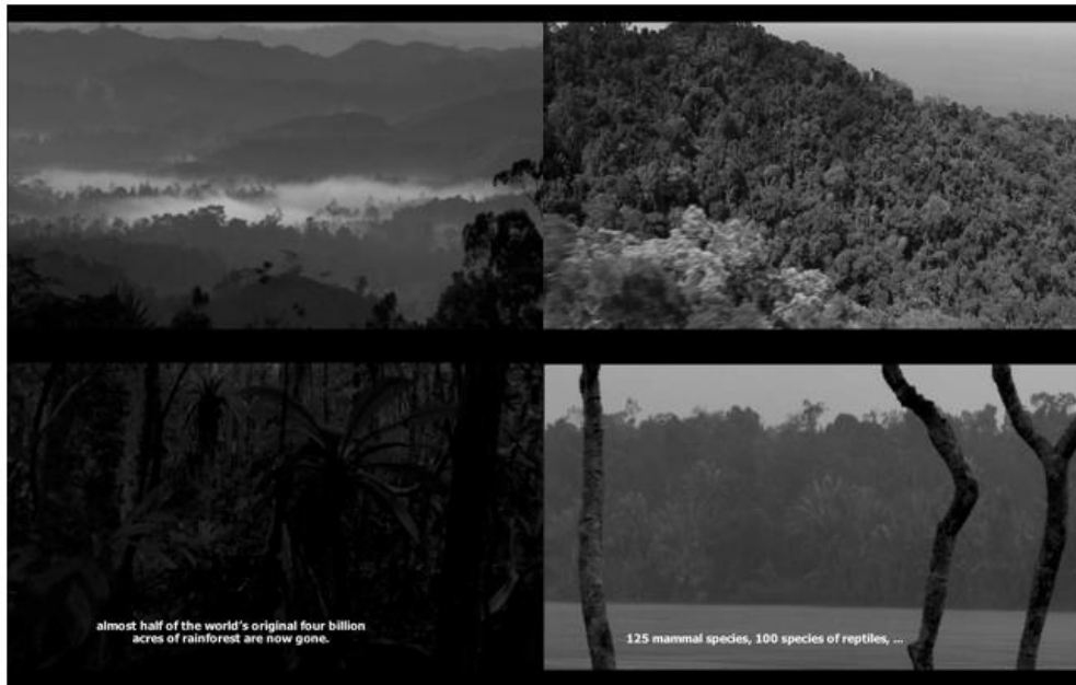
Figure 2. Images taken from Study 1 manipulation. On the top are snapshots from the neutral condition where no text was use; on the bottom left is a snapshot from the threatening condition, and on the bottom right is an image from the connecting condition (original images were presented in color).

As a framing for the study, participants were told that they were taking part in a study about images and visualization in reaction to a short film. Participants were randomly assigned to one of three conditions: (1) threatening, (2) connecting, and (3) neutral, which determined which of three videos they would see. Videos lasted 3 minutes, were visual only (included no audio), and showed above- and below-canopy film footage of rainforests (Figure 2); this visual content was identical across conditions.