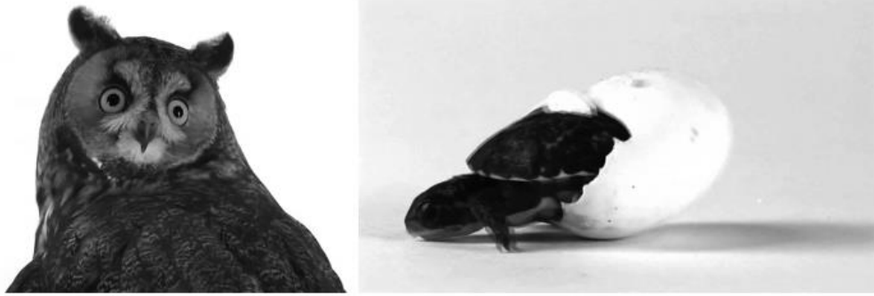
Figure 4. Images taken from video used in the Study 2 manipulation (original images were in color).