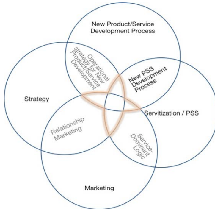
Figure 3 Relevant fields and research focus

Figure 3 depicts where the focus of this research lies, which is within the intersection of these fields represented by a four-corner star in the diagram.