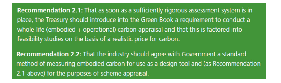
Fig. 1. Innovation and Growth Team's Recommendations [5, pp. 29-30]

'The Stern Review', commission by the UK Government in 2006, pointed to the overwhelming amount of scientific evidence that highlighted the serious risks of climate change and the need for urgent action towards reducing emissions of greenhouse gases on a global scale [1]. Although the estimates of emissions associated with the construction industry tend to vary it is generally accepted that one third to one half of UK's carbon dioxide emissions are related to the construction and operation of buildings [2,], [3], [4]. The Innovation and Growth Team's report, 'Low Carbon Construction' made a number of recommendations to implement a low carbon approach in construction in the UK. This report identifies the importance of whole life carbon assessment during the design process (see Figure 1 below).