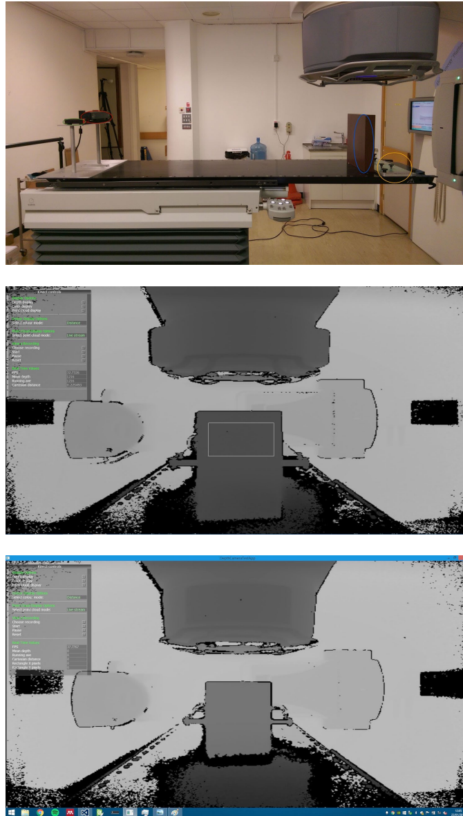
FIG. 1. Experimental setup and effect of electromagnetic interference on the displayed images. (Upper panel) The sensor (red) is mounted on a custom stand manufactured in-house. A thermometer is attached to the upper exhaust vent on the sensor. The Leica Disto D210 laser measure (green) is mounted securely next to the sensor, with the front plane lined up with the sensor. To the right, the solid water phantom (blue), used as the target, can be seen, along with the metal cross-plate (orange) screwed into the couch which ensures the phantom is perpendicular to the sensor. (Middle panel) A depth camera view of a linac and solid water phantom on the treatment couch; darker objects are closer to the camera and lighter objects are further away. A region of interest (ROI) drawn by the user on the phantom is shown as a gray outline. The mean Kinect reported distance value of the pixels in this (ROI) in every frame was recorded to a file. Image was taken without the PFN operating. (Lower panel) Worse-case image, with a PRF of 400 Hz. The circled region on the image indicates a region where additional image artifacts were observed.

The free Kinect for Windows Software Development Kit (SDK) 2.0 (17) was used to develop in-house software for capturing Kinect-reported distance data and displaying these data as a grayscale image related to the distance of objects from the sensor (see Fig. 1).