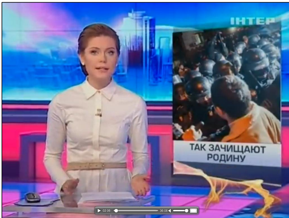
Image 3. A screenshot from the 20:00 Podrobnosti news bulletin on Inter , which showed the violence of Berkut riot police against protesters in a negative light (the photo is captioned ‘That’s how they defend their country’)