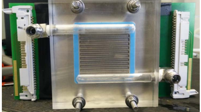
Figure 2. Successful integration of segmented PCB in PEMWE test cell with optical access

Hochschule Esslingen, Esslingen, Germany