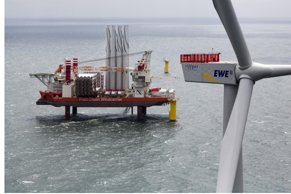
(b) Heli-boost platform on top of a wind turbine nacelle and installation ship/platform with helideck on the left side.