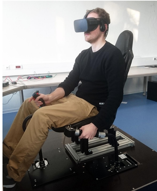
Figure 4: Testing our new VR cockpit simulator during the setup process.

that specifically adapts to the current task. The realization and evaluation of our concept idea leaves room for widespread research studies, which we will approach in our future work. As a start, we set up a flexible display design suite for various consumer-grade head-worn displays. 22 Moreover, we installed a new helicopter flight simulator including professional active force feedback controls. It is capable of simulating a conventional flight deck as well as a virtual cockpit environment (Figure 4).