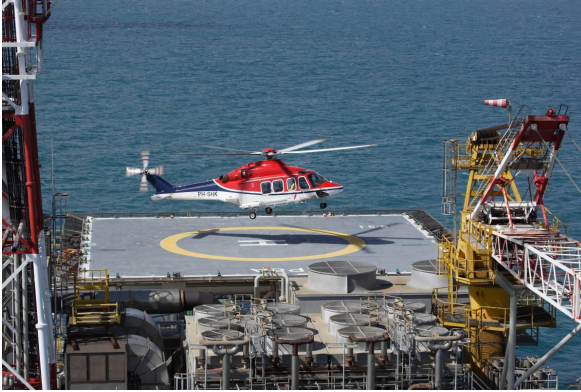
(a) Augusta Westland AW139 landing on offshore helideck surrounded by various obstacles.