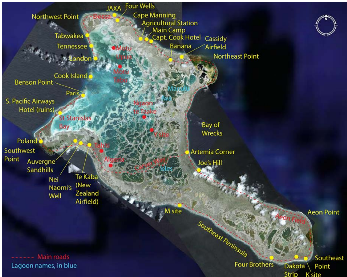
Figure 2. Kiritimati Atoll showing all localities mentioned in this article. Adapted from Google Earth. Image © 2015 DigitalGlobe.