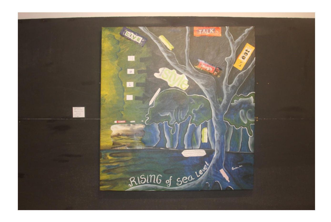
Painting by Esala Cauacu