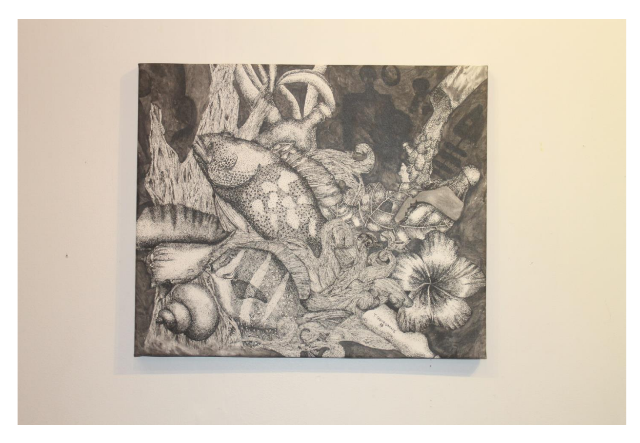
Painting by Tomasi Domomate