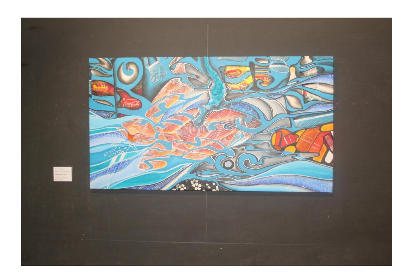
Painting by Ledua Peni