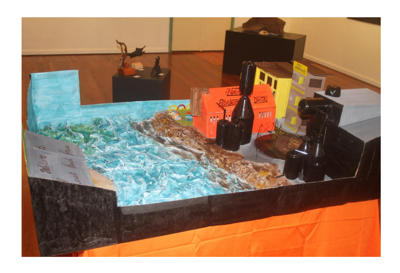
Sculpture by Kamla Naidu