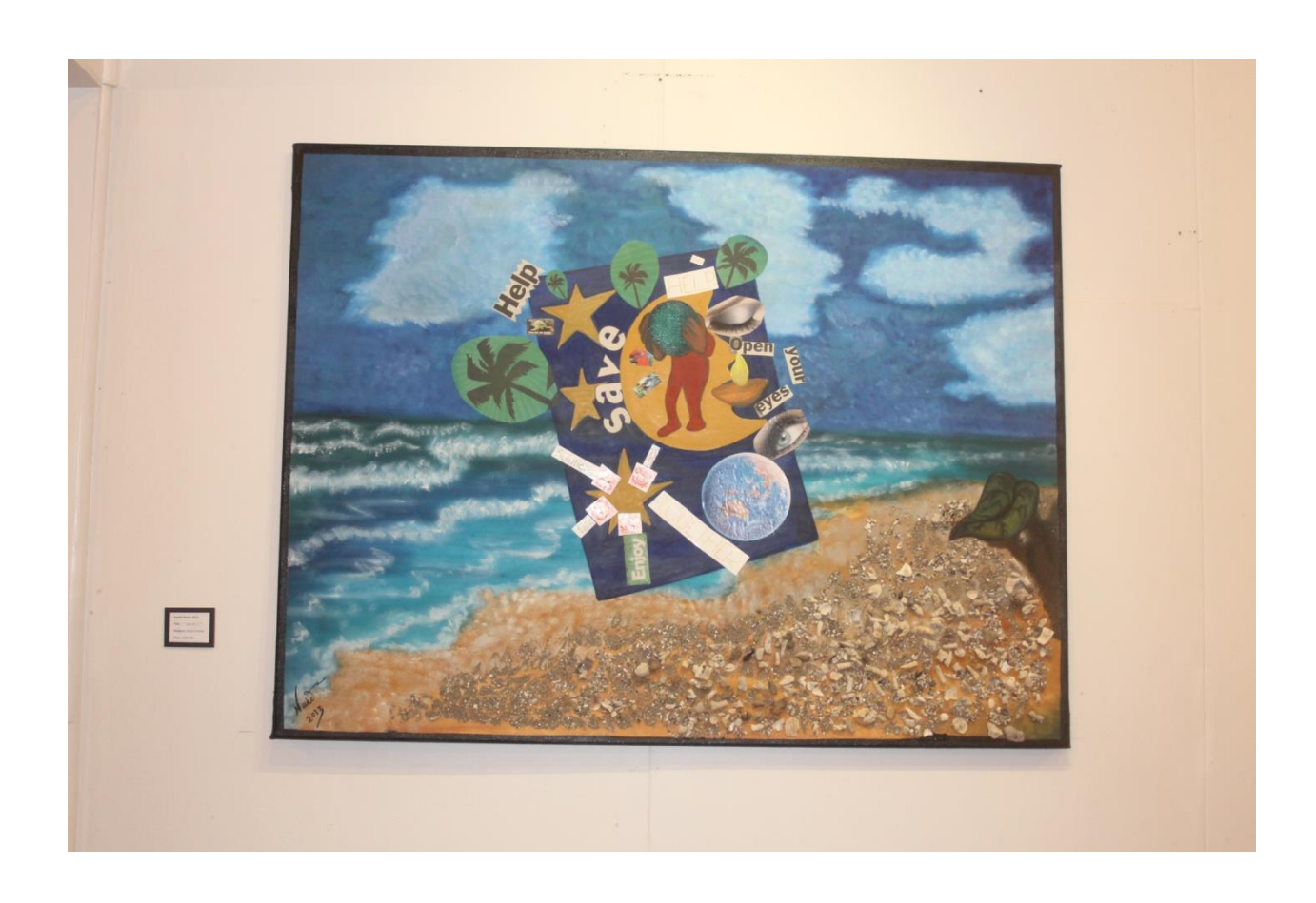
Painting by Kamla Naidu