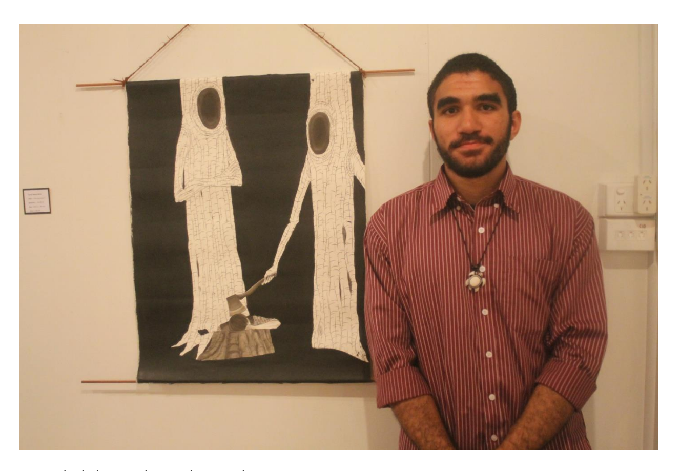
Pen and ink drawing by Tarek Waznek