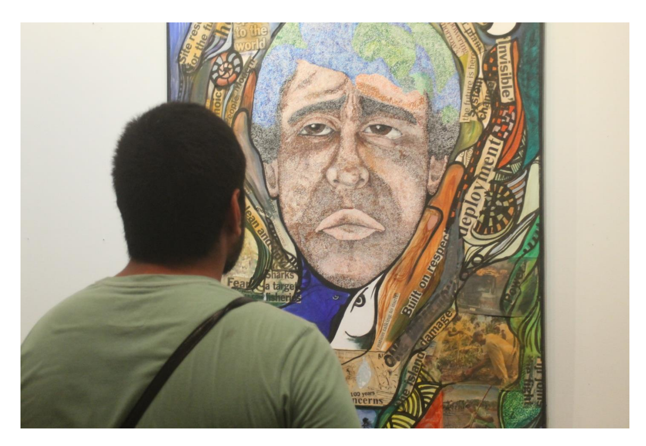
Painting by Tomasi Domomate