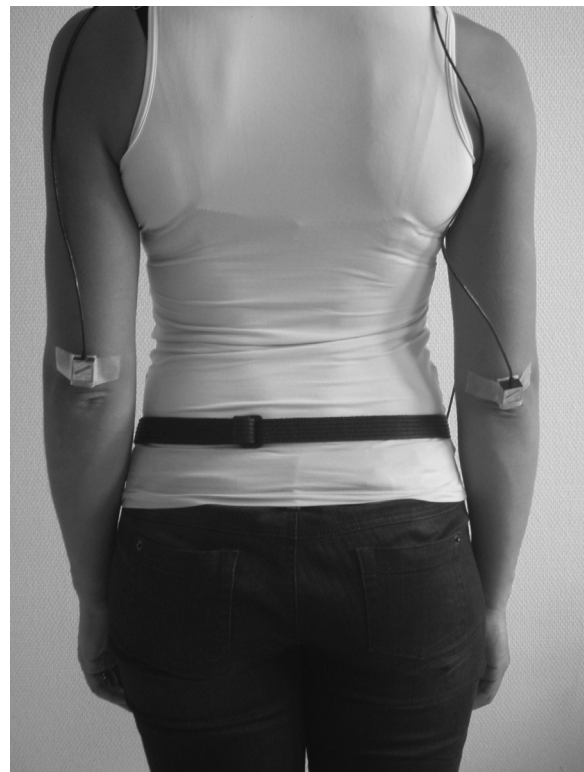
Figure 1 Placement of arm sensors during measurement.

The measurement method was the same as that described by Coley et al, 9 and the data analysis was based on the same algorithms. Miniature inertial modules were fixed on the dorsal side of each distal humerus to monitor arm motion and on the sternum to detect body posture (walking, sitting, standing) (Fig. 1). Each module consisted of 3 miniature gyroscopes (ADXRS 250, \pm 400^\circ/\text{s} ; Analog Devices, Norwood, MA, USA) and 3 miniature accelerometers (ADXL 210, \pm 5 g; Analog Devices). All signals were recorded at a sampling rate of 200 Hz by data loggers (Physilog; Gait Up, Lausanne, Switzerland) carried on the subject's waist. Each subject carried the system for a minimum of 7 hours (mean measurement time [standard deviation], 7.2 hours [0.9]) and was free to perform his or her regular duties as desired during this measurement period.