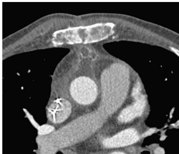
Fig. 1. Contrast enhanced CT-scan following second look surgery displays a retrosternal mass which patterns are consistent with an abscess: high attenuation rim, which circumscribes a low attenuation multilocated collection.

A patient, after surgical debridement and closed chest iodine solution irrigation, was reoperated for urgent suspicion of retrosternal abscess displayed by an intravenous contrast enhanced CT-scan. No signs of infection were found during surgery and at microbiological analyses. The abscess-like collection turned out to be local iodine solution accumulation (Fig. 1).