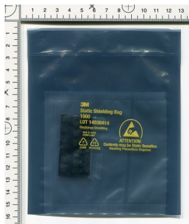
Figure 5. Internal parcel containing cocaine hydrochloride in different bags