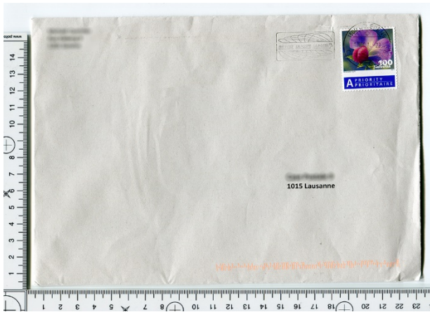
Figure 6. External packaging