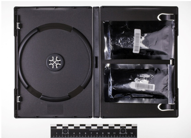
Figure 8. DVD keep case containing cocaine and MDMA pills in two different bags