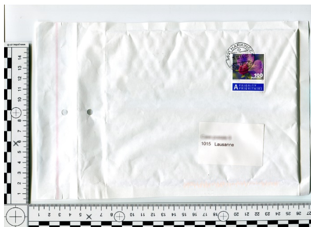
Figure 4. External packaging