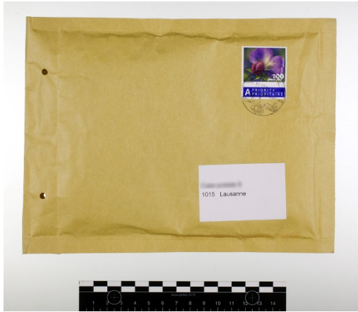
Figure 9. External packaging