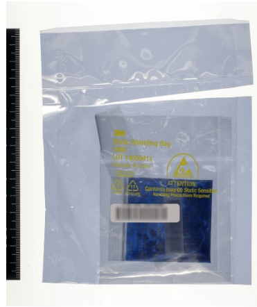
Figure 10. Internal parcel containing cocaine hydrochloride in different bags