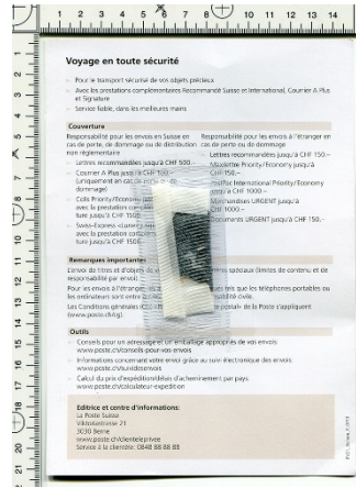
Figure 7. Internal parcel containing cannabis concentrate taped on a piece of paper