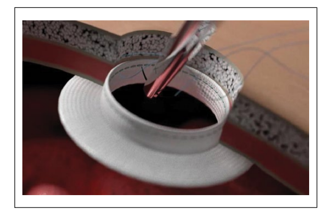
Figure 1. The stomaplasty ring (KORING) and its placement in the abdominal wall.