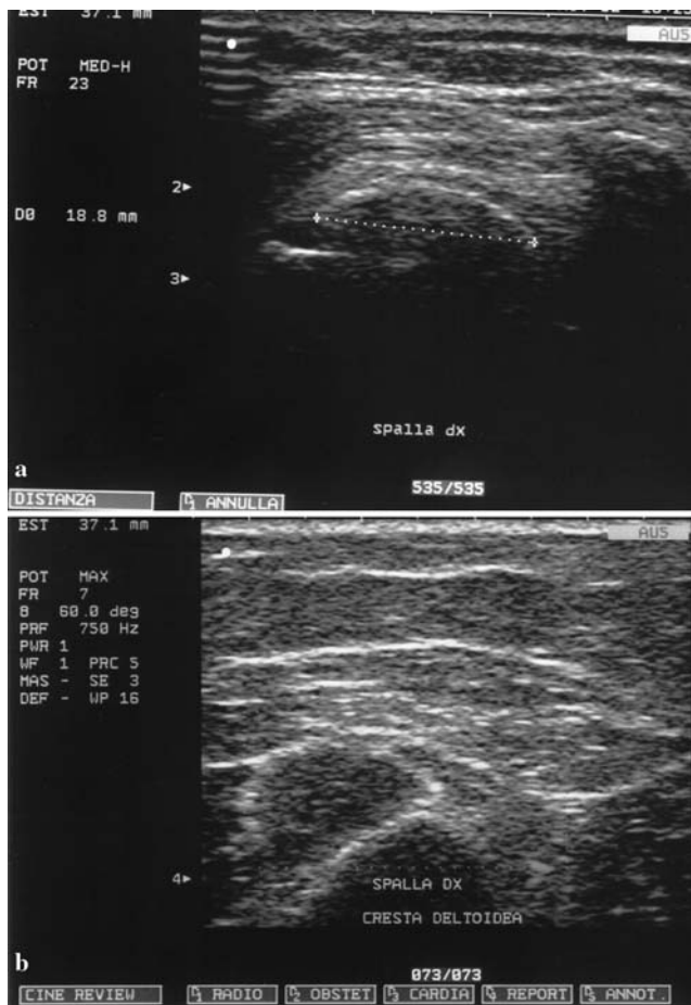
Fig. 3 a Transverse sonographic image of right supraspinatus tendon showing arc type calcific plaque before ESWT. b Sonographic control at 6 months showing disappearance of deposit

tendon appears to lead to accelerated breakdown of the remaining calcific structure.