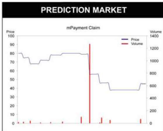
Figure 2: The output of the prediction market approach

On the contrary, prediction markets are excellent tools for longitudinal studies due to the inherent nature of the data collection process. However, they give the prediction (i.e., the claim's price) without further explanations. In other words, MCDM methods are detailed snapshots taken at certain times and prediction markets are movies shot over a period of time.