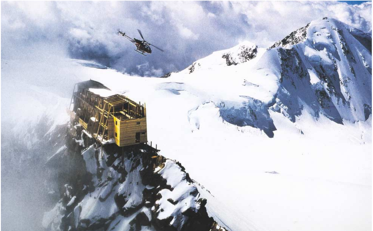
Figure 1. The High-Altitude Research Laboratory at Capanna Regina Margherita. The laboratory is located at the Swiss–Italian border at an altitude of 4559 m.

the institutional review board on human investigation, and all subjects provided written informed consent.