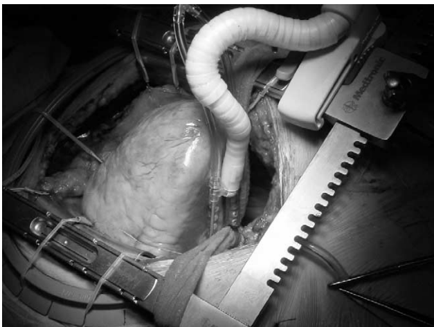
Fig. 1. Exposure of the posterior wall. The traction on the arms of the swab has enucleated the heart which stands like a pyramid. Note that the artery lies between the two arms of the swab and that no compression is applied on the heart chambers.

Then, the heart is elevated with one hand and a heavy monofilament suture (no. 1 Prolene, Ethicon, Somerville, NJ) is placed on the right side of the spine halfway between the level of the right inferior pulmonary vein and that of the inferior vena cava. The suture is passed through a half-folded swab (60 cm long and 10 cm wide) and snared down, bringing the folded end of the swab in close contact with the posterior pericardium. The basic principle of exposure is to pull on both limbs of the swab in a direction opposite to the target wall with the target artery located between both limbs. Once the appropriate exposure is obtained, each limb is fixed to the surgical drapes. Care is