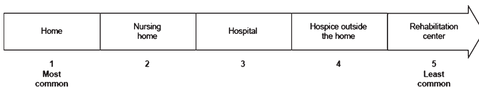
Fig. 2. Ranked end-of-life settings for patients with sIBM, based on the experience of 13 physicians from seven countries. Each physician was asked to score the end-of-life settings shown above (1 = most common, 5 = least common). Based on all the physicians' responses, the mean score was calculated and used to rank the settings. sIBM, sporadic inclusion body myositis.