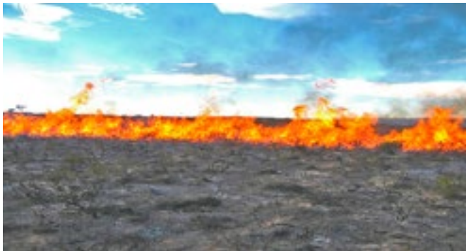
Figure 1. Fire sweeping through the kwongan shrubland in SW Australia.