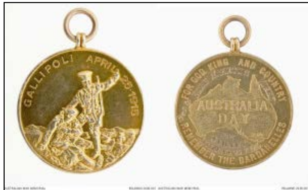
The Wharton-Kirke Medallion Struck in Gold

25mm. Bronze, silvered, gilded, silver & gold. Carlisle 1915/5.