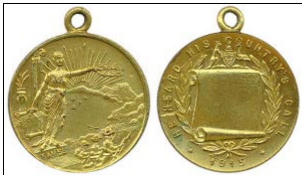
Obverse: GALLIPOLI / 1915 / FAMES

Carlisle 1915/9 carries the date 1915, but this refers to the date of the Gallipoli campaign and not necessarily the date of issue. References to presentation pieces like this began to appear from late 1915, but the majority appeared in 1916 and some even later.