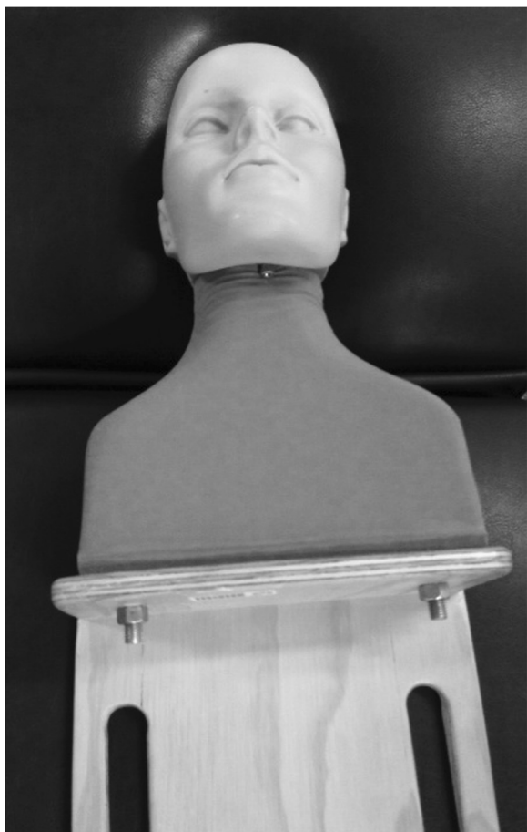
Fig. 1 The mannequin

three, two hour weekly training sessions in the performance of a commonly used cervical spine manipulation technique referred to as the index pillar push [21]. During the weekly training sessions and to ensure that the assessor remained blinded to group allocation students were supervised by academics not involved in the assessment of the students. The supervising academics provided each student with regular personalised feedback relating to their performance of the required technique during the weekly training sessions. After the third weekly training session, all members of each group crossed over and undertook three additional training sessions using the alternate method. The flow of the study is displayed in Fig. 3.