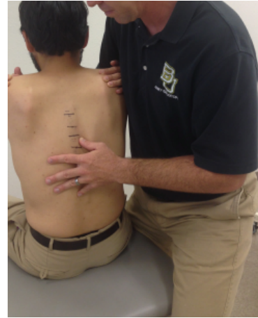
FIGURE 1: Motion palpation setup.

2.3. Examination Procedures. Participants were examined by both raters twice, once with their own pragmatic motion palpation method and once with a standardised method of motion palpation as described by Bergman and Peterson [1]. During the pragmatic procedures, examiners used the method they would normally use to assess intervertebral motion in a clinical setting. The standardized procedure consisted of assessing passive physiologic motion of flexion, extension, bilateral side bending, and bilateral rotation, followed by segmental intervertebral mobility testing. Each rater was blinded to whether or not each participant had back pain and to the findings of the other rater. In addition the order in which participants were examined by each rater was changed on the second round to minimise any memory of findings. Participants were seated on a fixed examination