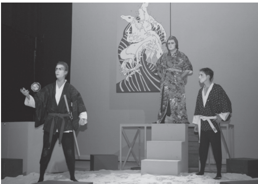
Figure 1 Samurai

Banquo's murder, rather than a rapidly executed action by the assassins, became a dans macabre by the geisha (a troop of three women performers) followed by an extended Butoh movement piece in which the actor, only recently skilled in this mode of performing, drew on all his capacities and energies in order to realize the anguish of a character mercilessly killed for another's advancement. As an instance of the transfer