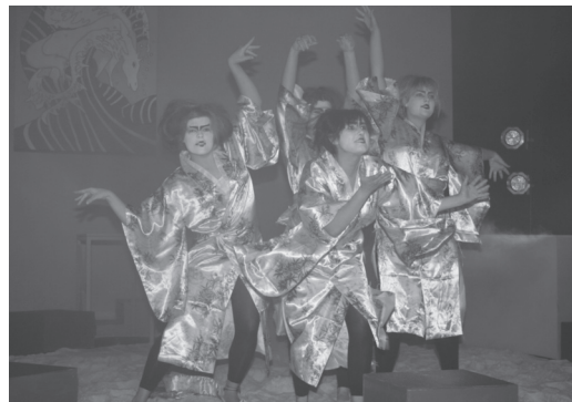
Figure 2 Shamans