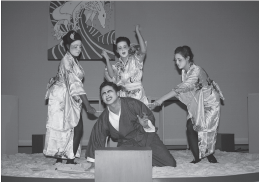
Figure 3 Geisha