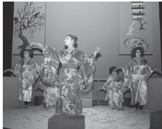
Figure 10 Set and Costume