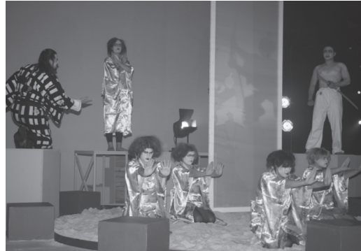
Figure 4 Wayang Kulit

of knowledge and experience from one cultural tradition to another, this moment in the performances was among the most successful: audiences were swept away by the power of the death of Banquo as were all the members of the ensemble. The choreographer's achievement in bringing the student performer to this pitch of intensity (and credibility) in the short span of time allotted to them was one of the great achievements in this dangerous experiment. The movement workshops and choreography were developed and designed by a PhD student under my supervision, a devotee of the Temple of Fine Arts. His work on the movement for this production with all the actors, from the samurai/warlords to the aristocratic women of the courts (Lady Macbeth and Lady Macduff) as well as the geisha assassins, provided the performers with heightened skills in traditions with which they were entirely unfamiliar, but which they came to respect and cherish as the rehearsal phase evolved.