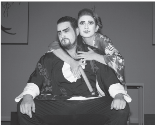
Figure 9 Make-up

The effect for the performers, and for the young audiences who viewed the production, was of a verfremdung or ‘alienation’ in Brecht’s sense, arguably liberating them from the constraints of a western traditional orientation in the design that might have used kilts, sporrans and cabers as opposed to the kimonos, wooden samurai swords and leather armour that adorned the characters in our version of the play.