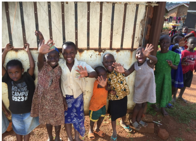
Figure 1c: Centre of Development & Outreach (SOHA), Kampala Uganda.

Agriculture is imbedded in a political and socio-economic environment and any innovative technology has to be scaled for local environment. Favourable policy environment should be established (iiii) to bring in the wide scale change to the food and water security situation in the targeted countries. The innovative programs should engage in a sustainable way, which means increase of yield in the context of scarcity of natural resources and threats against fragile livelihoods, and at the same time, facing constraints linked to climate change, competing energy chain values and dwindling natural resources. The innovations should be linked to capacity building, in terms of human, institutional competence development and infrastructure establishment.