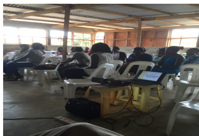
Figure 1b: Centre of Development & Outreach (SOHA), Kampala Uganda.