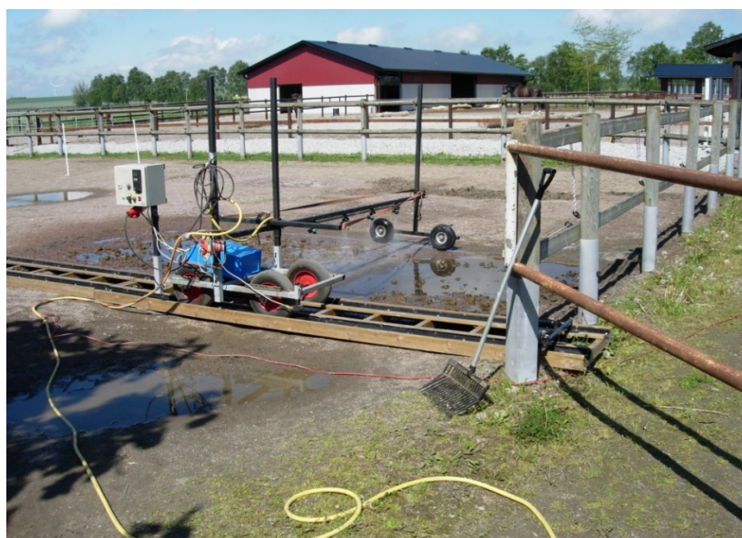
Fig. 3 Rainfall simulator at work. The boundaries of the test area are determined by the simulator rail and the spray boom. Run-off drain was placed 0.25 m inside and along the fence to which the slope direction was.

The second winter season, from October 2013 to March 2014, was rainy except for a frosty period at the end of January (Fig. 2). All winter measurements