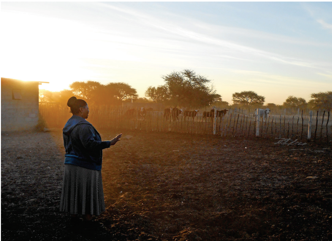
Watching cattle coming home.

However, women in Ghanzi District also engaged in other ways, and the women in my sample were positioned differently in terms of access to fences, grazing land and cattle, labour and the market in ways that were gendered but also shaped by intersecting axes of ethnicity, race and class, defining how access is mediated by social identity and through other social relations (Ribot and Peluso 2003). Their access to resources to deal with challenges of drought, regulations linked to EU beef export and with breed management differs, as shown in the narrative at the beginning of the introductory chapter. In the next chapter I discuss how women also situated themselves in different ‘cultural traditions’ of cattle farming through which gender is done by both conforming to and challenging those ideas.