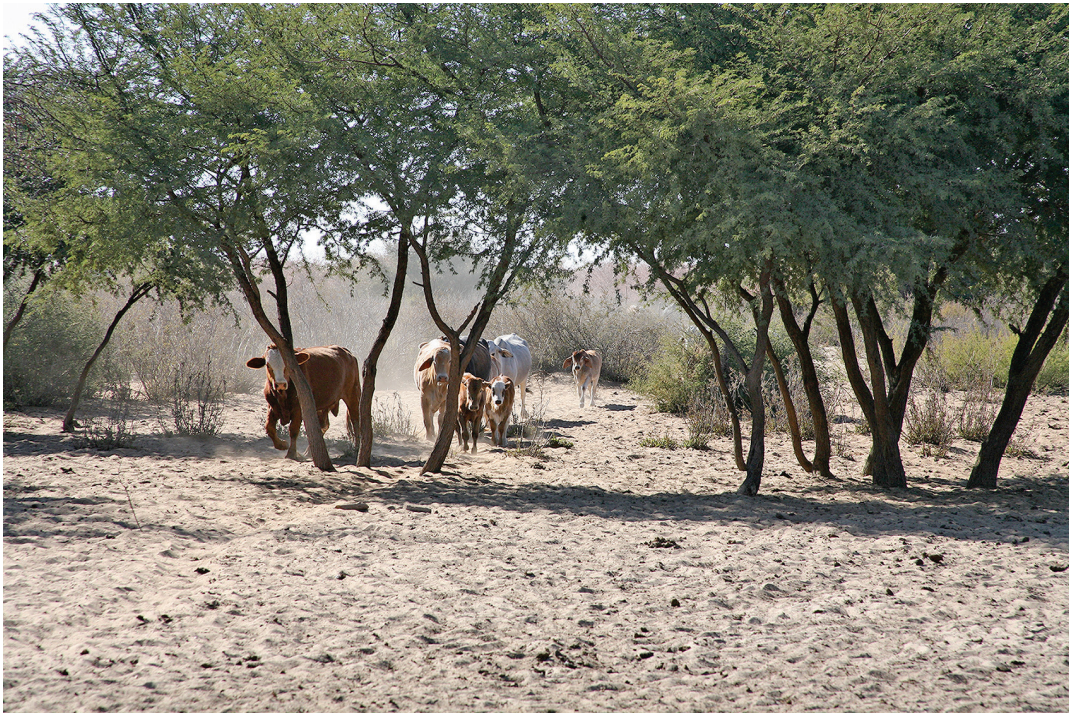
Cattle coming in to drink.

The picture that emerged was that ‘rich, white women’, Herero women and widows might have property relations to cattle that differed from the ‘normal’. These were the women who were imagined to have stronger possible claims to cattle and control over cattle assets than other women. These common ideas around women’s participation in cattle production give us a feel for the context within which cattle farmers operate, however fluctuating they may be. The association of cattle with men in the socio-symbolic realm (Rao 2008) was strong and although certain women were identified as being engaged in cattle production, they were framed as exceptions in Botswana, thus maintaining the general ‘rule of the game’ (Kandiyoti 1988, 1998) that cattle were a male affair. While not a conscious effort, the reproduction of these ideas renders women an invisible group in the cattle sector, while actually highlighting the involvement of certain specific groups. These groups do indeed engage in cattle farming, and in the next section we shall see how women kept their cattle on fenced and non-fenced grazing land and what happens around their kraals .