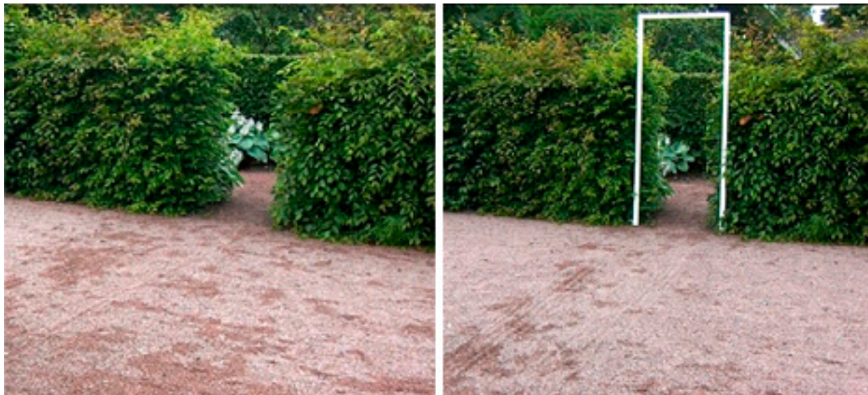
Figure 1. (a) Passageway through only the hedge opening; (b) and through the hedge opening with the white doorframe.

The study was conducted at the Alnarp Rehabilitation Garden, situated at the Swedish University of Agricultural Sciences, Alnarp Campus, 15 km from Malmö in the south of Sweden [55]. This garden has several 2 m high, dense hornbeam ( Carpinus betulus ) hedges, with openings specially designed for the test (Figure 1a).