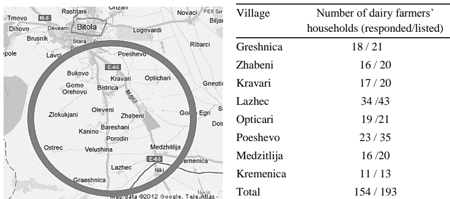
Table 5 Graphical presentation of the villages' dispersion in the sample area and number of respondents in each village

It should be noted that the standard statistical sampling procedures are not suitable for SNA, and are only applicable in the case of egocentric networks (Marsden, 1990). This makes sampling in SNA a difficult and risky practice, since there is a risk of omitting important relations by not including all actors in the network. Therefore in most instances, it is the researcher that decides on the boundaries of the sample, which would be most suitable for testing of the research hypothesis (Wasserman and Faust, 2009). The literature on sampling in SNA approves sampling in cases where complete enumeration of actors is available and was followed, attaining in this way full information on all the existent relations in the network of interest (Scott, 2000).