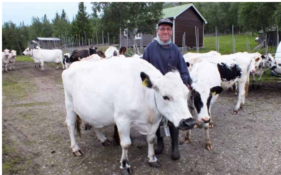
A farmer at Nyvallen, Härjedalen, Sweden, together with the leading cow Nejljika [Carnation], an 18-year-old Swedish mountain cow with plenty of experience. July 2012.

The species richness of grazed forests and alpine areas varies with climate, soil conditions, supply of nutrients and water, and the intensity of grazing and