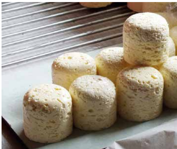
Dairy products produced at different Swedish summer farms represent local specialities from traditional small-scale food handicraft.

Acknowledgements: We are very grateful to the farmers and key informants from Budalen, Forradalen, Sånfjället, and Klövsjö, as well as other contacts related to the summer farm pastoralists for sharing their knowledge with us. This study was a part of the project “Grazing of outlying land — a biological cultural heritage as resource for a sustainable future” (R30441-66-11) financed by Interreg Sverige-Norge.