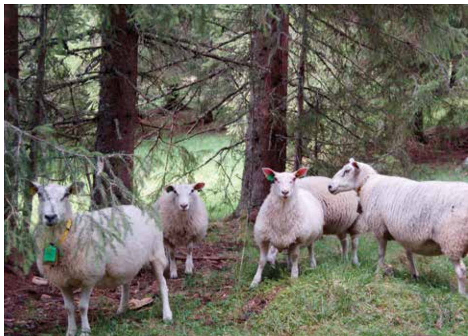
The summer farm is a place where history and present meet. Svedbovallen, Hälsingland, Sweden, July 2009, and Litj-Tyldvollen, Forradalen, Sør-Trøndelag County, Norway, August 2009.

ment” of the protected ecosystem, although much of the biodiversity has developed in a grazed, semi-open wooded landscape. In the end, however, there is only one landscape.