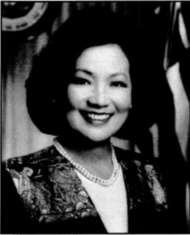
Mazie K. Hirono Lieutenant Governor, State of Hawaii