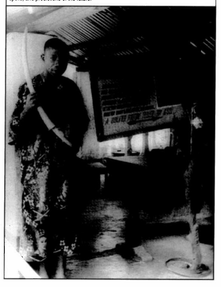
Figure 4.— Igbo healer, in his treatment facility. Services include medicinals, incantations, spells, and predictions of the future.

Finally, keep in mind that your search, even if kept quite simple can be very important. Despite the long history of chemical and physiologic investigation of culturally interesting materials, plant, animal, insect, arthropod, and marine, new screening methods of incredible sensitivity and speed offer a major research opportunity for what you might find.