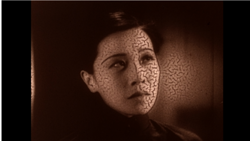
A scene from New Woman , A film by Chuk-Hau Rita Tse