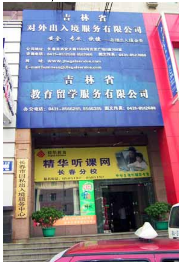
The rather stately exterior of a “window” company in Changchun, Jilin province, northeast China.

The intermediary chains did not come from nowhere. The trap had its historical roots in the command economy of the pre-reform era and was a direct product of state-led liberalization. The state bureaucracy and the intermediary chains, both hierarchically organized, intersected with each other at all levels. Most staff in the intermediaries in China had connections with government. Intermediaries sometimes had deeper connections with government agencies at the same level than they did with their business “downstairs” or “upstairs.” In some sense, intermediary chains can be seen as a mirror of the state bureaucracy. Therefore, in order to understand how the intermediary trap emerged at this particular juncture in China, we must examine general changes in state regulation of mobility.