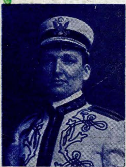
FEATURED BY Bert Morphy